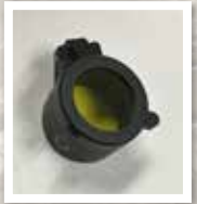
Polaris Amber Lens Cover