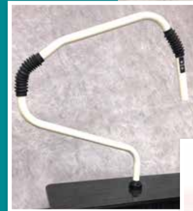
Polaris Desk Mounted