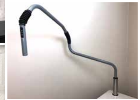
Polaris Pole Mounted